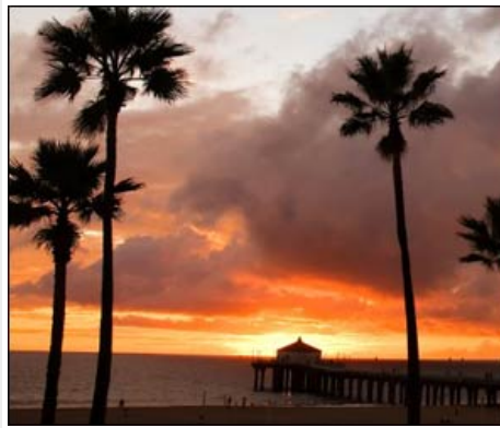
About these ads

So, if you've looking for a fun show (90 min.) and a good cause (not-for profit theater) and you're in Philly (until the 26th), do check out Xanadu ( click for tickets ), because who doesn't want to have Olivia Newton-John songs stuck in their head for a week?